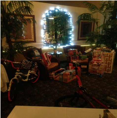
Toys donated by our affiliates and members