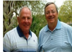
Fourth Flight Winners