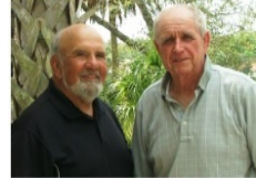
Sixth Flight Winners