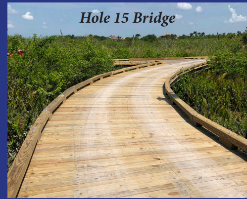
Hole 15 Bridge