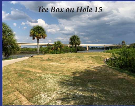
Tee Box on Hole 15