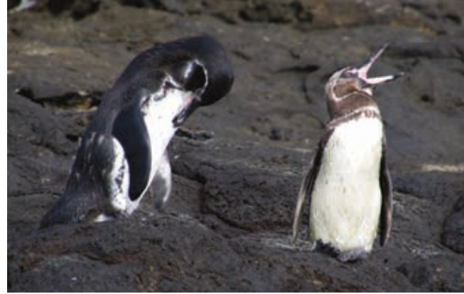
Galapagos Penguins, the only penguin living north of the equator. "La, La, La!"