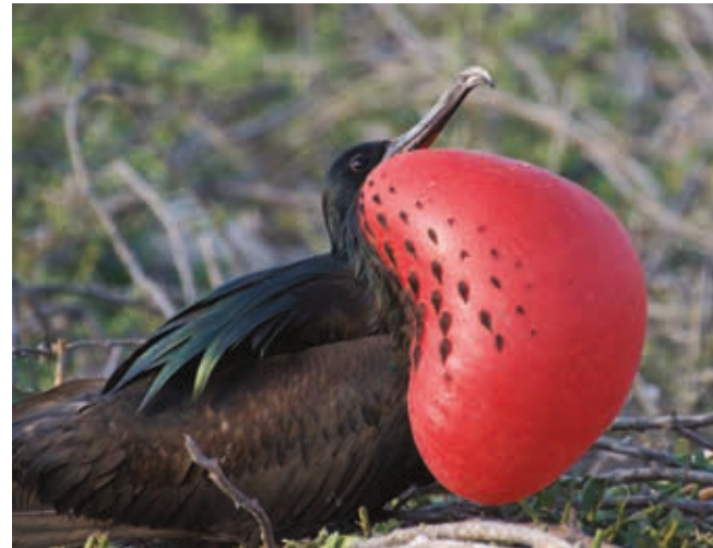
A male Magnificent Frigatebird with its bright red pouch inflated to attract a mate.

Our "home" for a week was on Celebrity Cruises' beautiful mega yacht, appropriately named "Xpedition," complete with a spa, dining room, lounge, bar, outdoor deck & grill and other amenities. Sailing a total of 567 miles, we visited a different island each day. Each island had its own unique terrain, varying