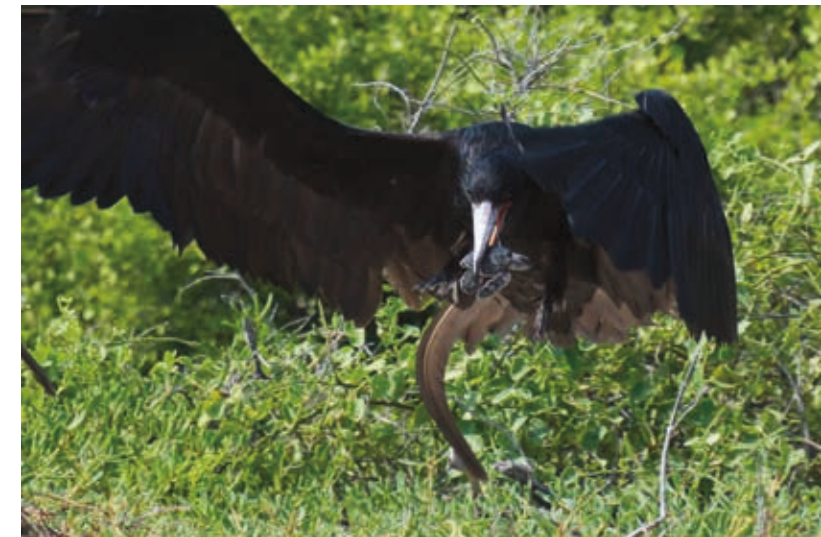
A Magnificent Frigatebird snatching a newly hatched baby turtle over a turtle nest on the beach.

from volcanic to red, white or black sand beaches. Daily rides on zodiacs provided fun, safe transportation and close views of the wildlife. A visit to the Charles Darwin Research Station and giant tortoise breeding center was followed by a delicious lunch in an open-air restaurant in the forest while watching young locals perform traditional dances. Then, a guided walk amongst wild giant tortoises topped our awesome trip. We were able to see first hand the adaptation of species that Charles Darwin discovered there back in 1835.