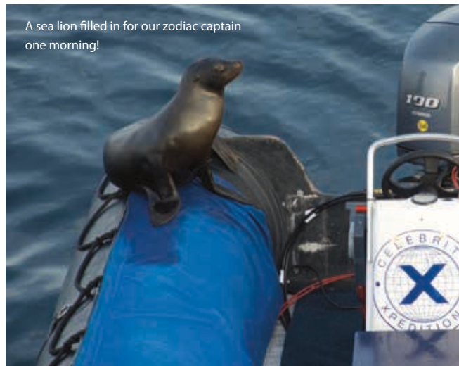
A sea lion filled in for our zodiac captain one morning!