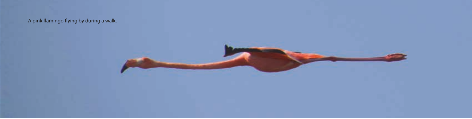
A pink flamingo flying by during a walk.