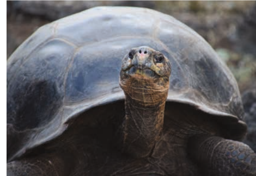
A giant tortoise on Santa Cruz Island. The Galapagos giant tortoise is the largest living species of tortoise in the world.