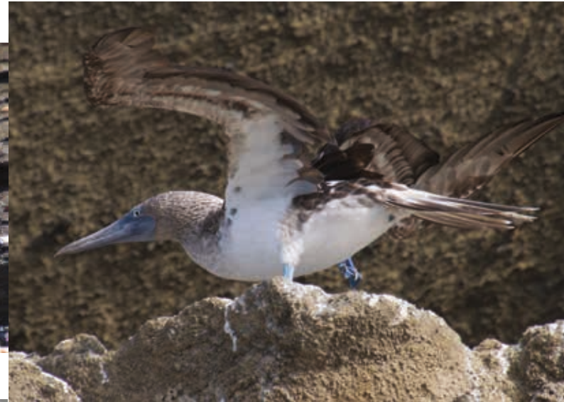
Blue-footed Booby bird doing its dance, lifting its foot to attract a mate.