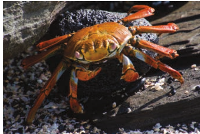
A colorful Sally Lightfoot Crab eating.