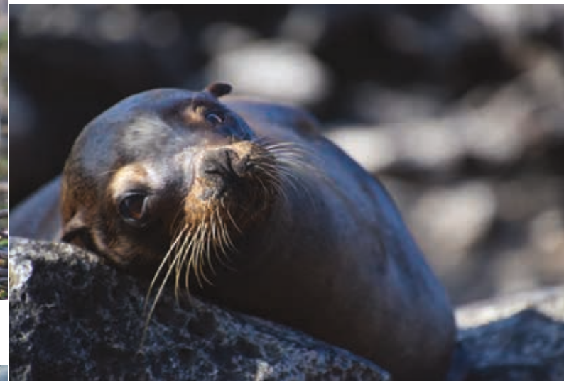
Adorable fur seal lounging on boulders.