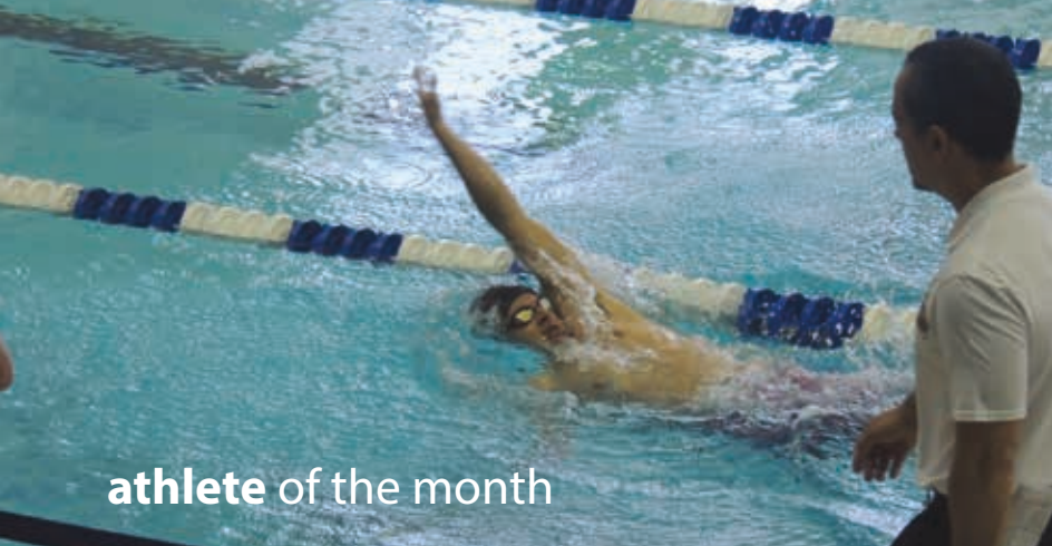
athlete of the month