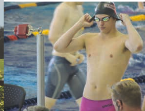
Behind the Blocks