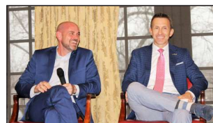
Allied Association Co-ops