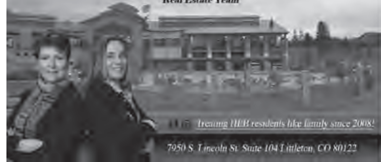
Treating HEB residents like family since 2008!

7950 S. Lincoln St. Suite 1041, Littleton, CO 80122