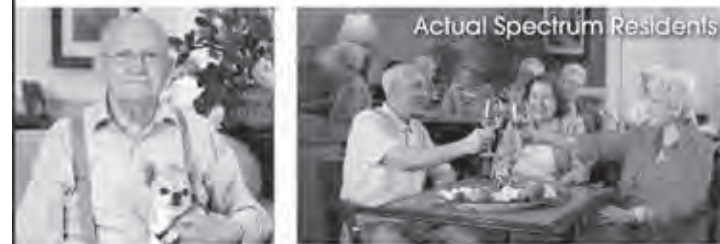
Actual Spectrum Residents