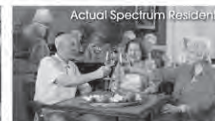
Actual Spectrum Residents

Give us a try! Month-to-month lease and 60-day money back guarantee!