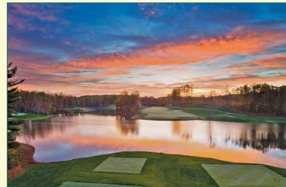
Highly touted Lake Presidential is a Gold Course that also offers Silver Members a privilege.