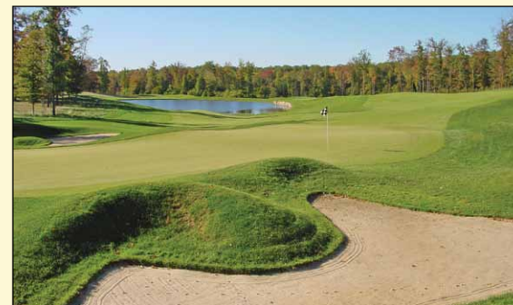
Bulle Rock returns as a Gold Patron course.