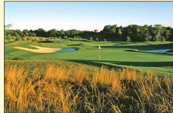
Play Musket Ridge Golf Club.