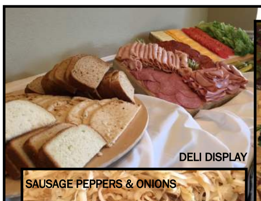
SAUSAGE PEPPERS & ONIONS

Catering reservations must be made minimum of 3 days in advance. Keep in mind, this is a great way to utilize your Food Minimum!!!