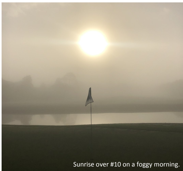
Sunrise over #10 on a foggy morning.

THE OFFICIAL JUMPSTART NEWSLETTER FOR ALL THE HAPPENINGS AND NEWS AT GRAND HAVEN GOLF CLUB