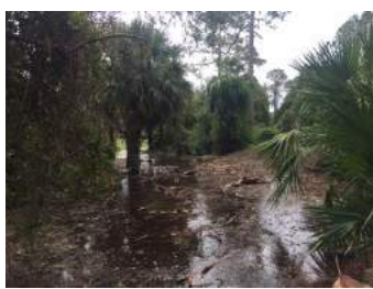
HURRICANE IRMA AFTERMATH