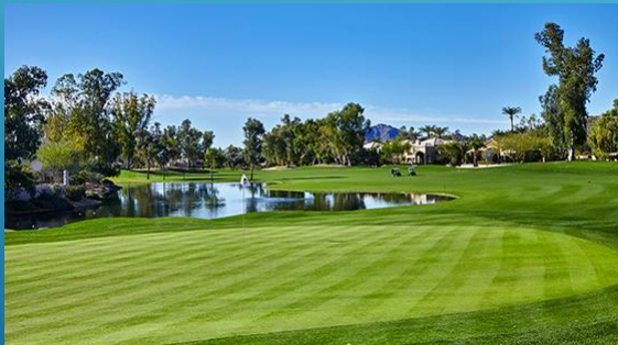
Gainey Ranch Golf Club Scottsdale 90% Reclaimed 10% Groundwater