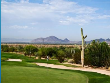
Ancala Country Club Scottsdale 100% Untreated CAP