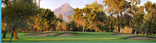
Phoenix County Club 75% Groundwater, 25% SRP Surface Water