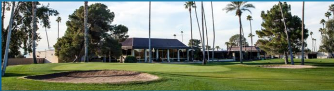
Palmbrook Country Club 100% Groundwater