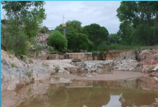
Del Lago Golf, Vail, Arizona 75% Surface Water