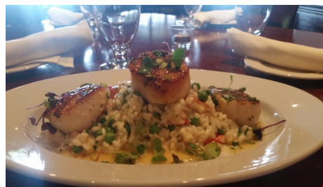
Sea Scallops over Lobster Risotto