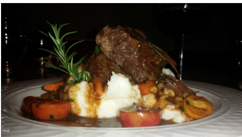
Braised Short Ribs over Whipped Potatoes & Vegetables

Check out some of JR's previous dinner specials!