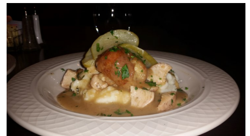
Chicken and Dumplings