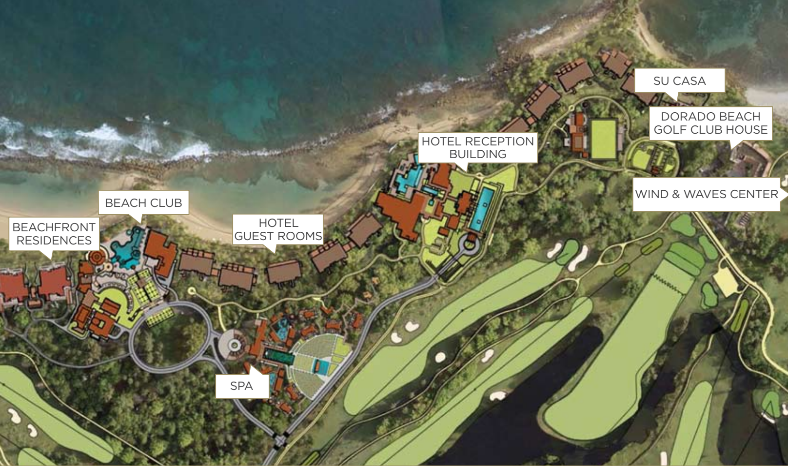
RITZ-CARLTON RESERVE SITE PLAN

In 1958, on the lush grounds of a seaside plantation, conservationist Laurance Rockefeller created the private world of Dorado Beach, one of his three original Rockresorts, the first true luxury island resorts. Today, the reconstruction of Dorado Beach Resort is underway, guided by Rockefeller's initial vision of combining contemporary design, local culture, sustainability, and barefoot sophistication. The centerpiece of the reconstruction is Dorado Beach, a Ritz-Carlton Reserve, the first of Ritz Carlton's new ultra-luxury hotels in the Americas and only the second in the world. A variety of new Club facilities have also been recently completed, are under construction, or are planned for completion in December 2012 along with the new hotel.