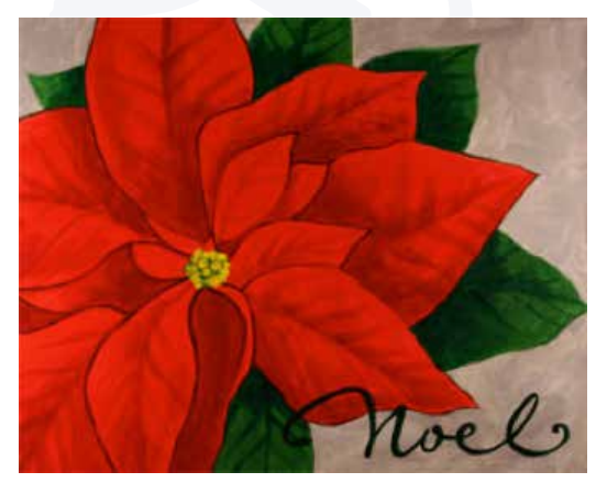
(Actual picture being painted)

Cookies Assorted mini pastries Pecan Pie Asst. cakes Apple cider