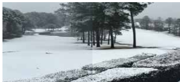
Berkeley was ready for the Holidays