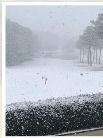
Snow Day at Berkeley Hills Country Club