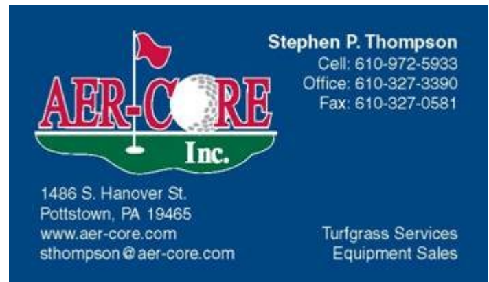
Photo of the Month