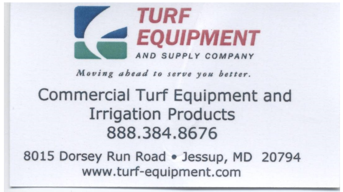
Photo of the Month