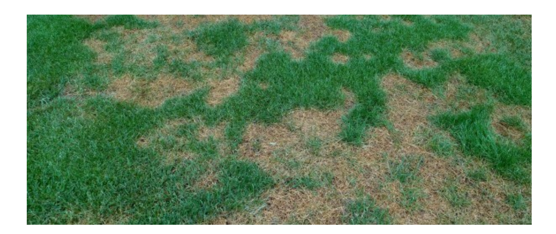
August 7, 2015

Having had mild summer weather in 2013 and 2014, diseases like summer patch have not been a big problem in the last two years. Summer patch is mostly a disease of Kentucky and annual bluegrass and creeping red fescue. It was the heavy rain storms and high temperatures in late June and July that brought summer patch back to the forefront in 2015.