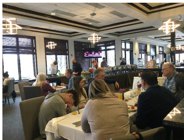
The first Sunday Buffet of the season!