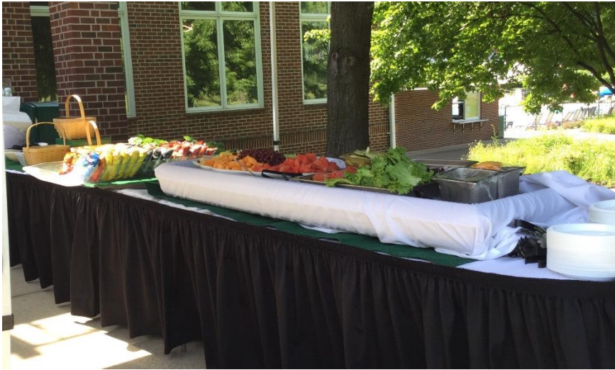
Chef and his team laid out a great spread, as always!