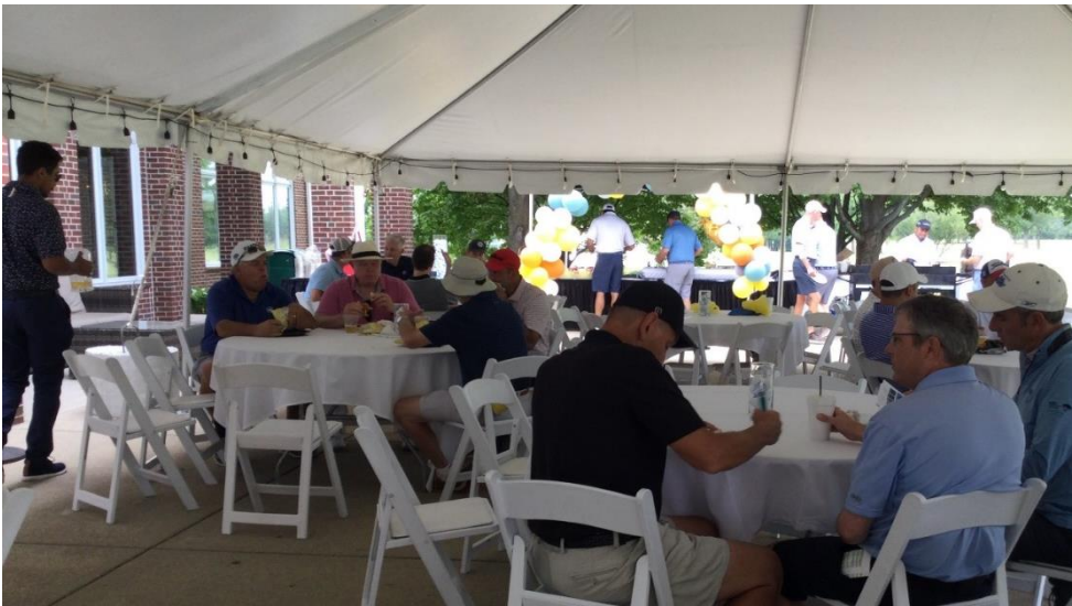
After lunch the putting green was packed!