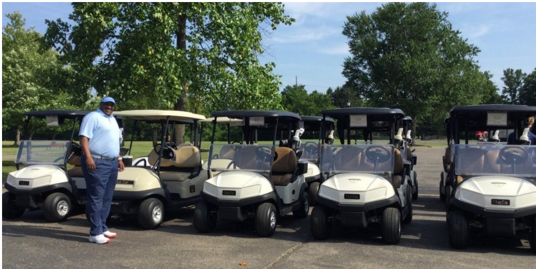
James was ready!

The weather was perfect! The day started with golfers rolling up and getting their carts set. The practice range and putting green became very active around 11:30, with lunch available on the patio. After opening remarks and instructions by James, golfers went out on a shotgun start at 1:00pm.