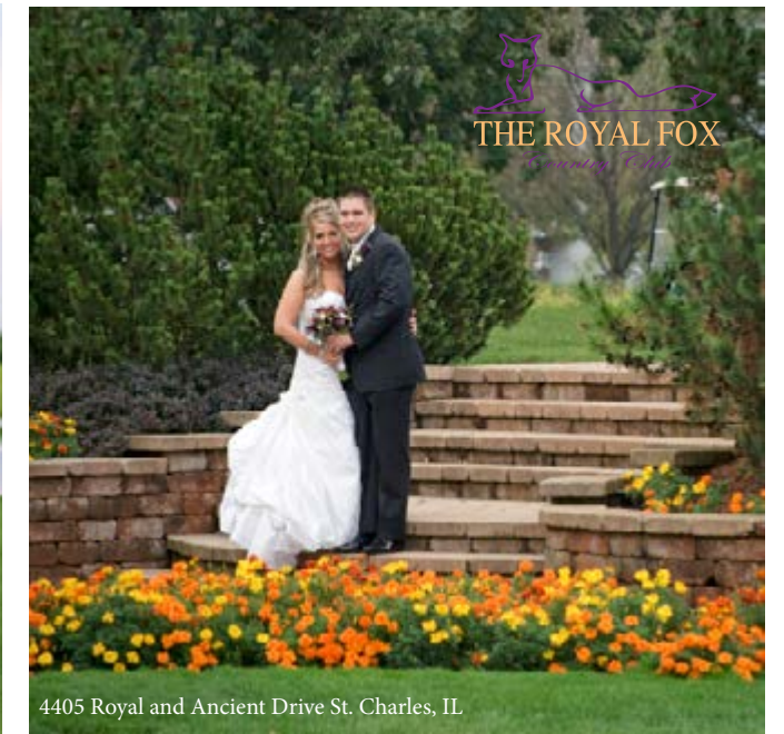
4405 Royal and Ancient Drive St. Charles, IL