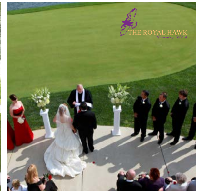
5N748 Burr Road, Saint Charles, IL 60175