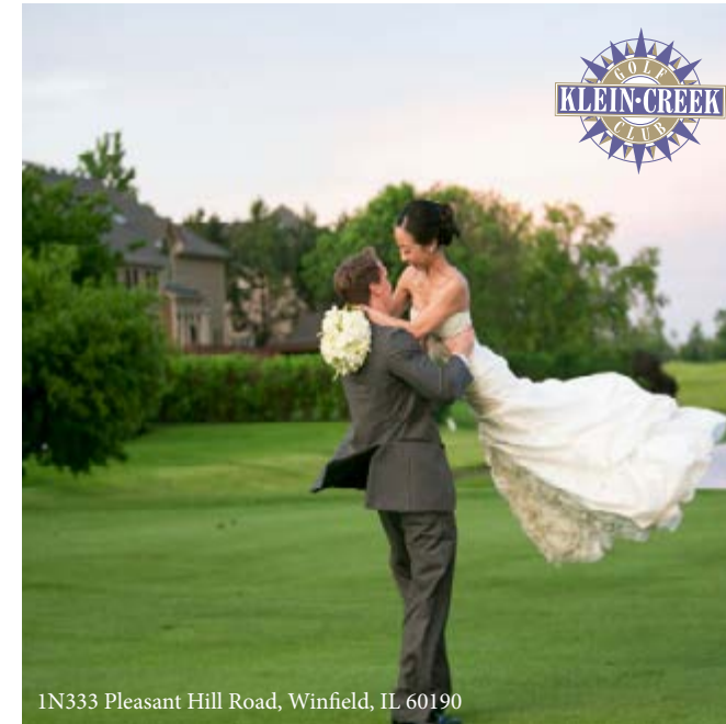
1N333 Pleasant Hill Road, Winfield, IL 60190