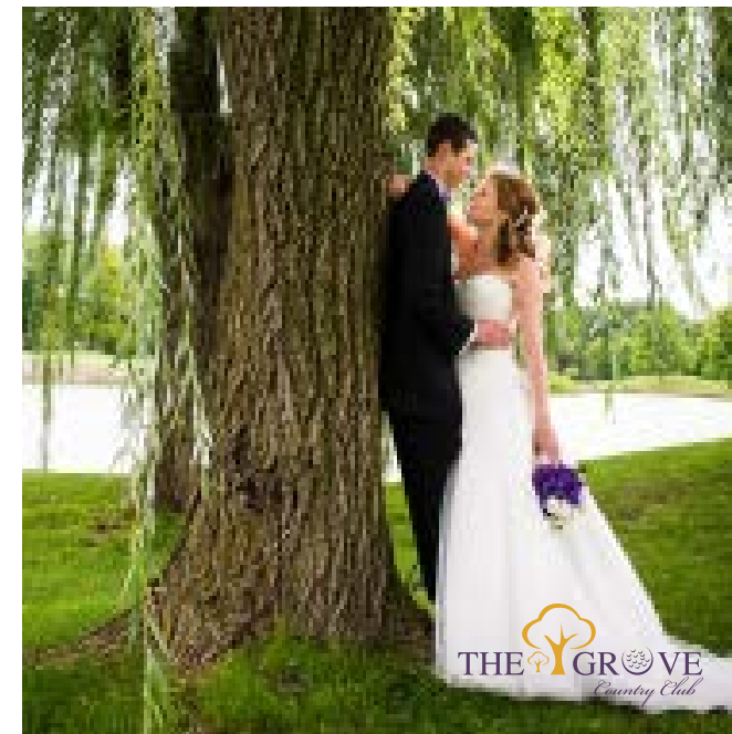
3217 R.F.D., Long Grove, IL 60047