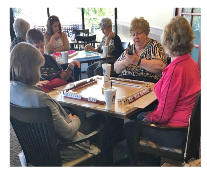
If interested, please contact: