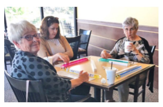
Thursday is Ladies Day Bridge

Come join the Mahjong ladies on Wednesday afternoons for food and play.