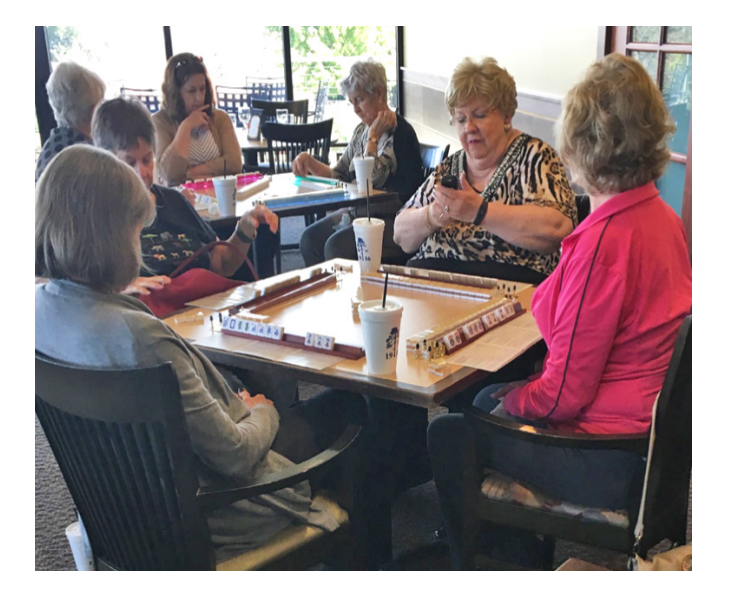
If interested, please contact: