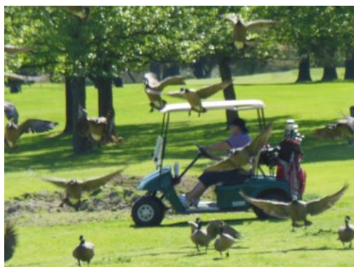
Val Holzer chasing the geese