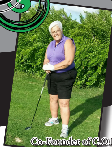
Co-Founder of C.O.P.S. & Executive Director Emeritus

Date: Friday April 10, 2015 Where: Lake Valley Golf and Country Club Camdenton, MO Format: 4-Person Scramble Time: 12:00 p.m. Registration 1:00 p.m. Shot Gun Start 6:00 p.m. Dinner/Karaoke/Live Auction