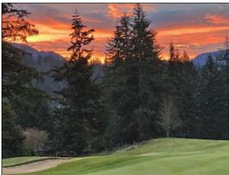
Sunrise on the Course

This rule is particularly helpful when the green is damaged or wet, ensuring fair play without penalty.