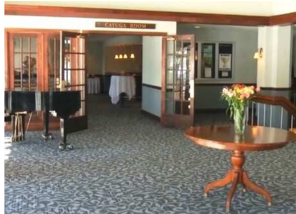
The Cayuga Room at Lancaster Country Club

Assorted Fruit Juices Coffee and Tea Bagels and Pastries Fresh Fruit Bowl Eggs Benedict, Quiche Lorraine or Scrambled Eggs* Deli Platter with Cold Cuts and Cheeses Bacon and Savory Sausage Potato Pancakes or Home Fries Crème Brulee French Toast Choice of House Salad, Caesar Salad or Strawberry Caesar Salad *Made to Order Omelets add $3 per person $22 per person*