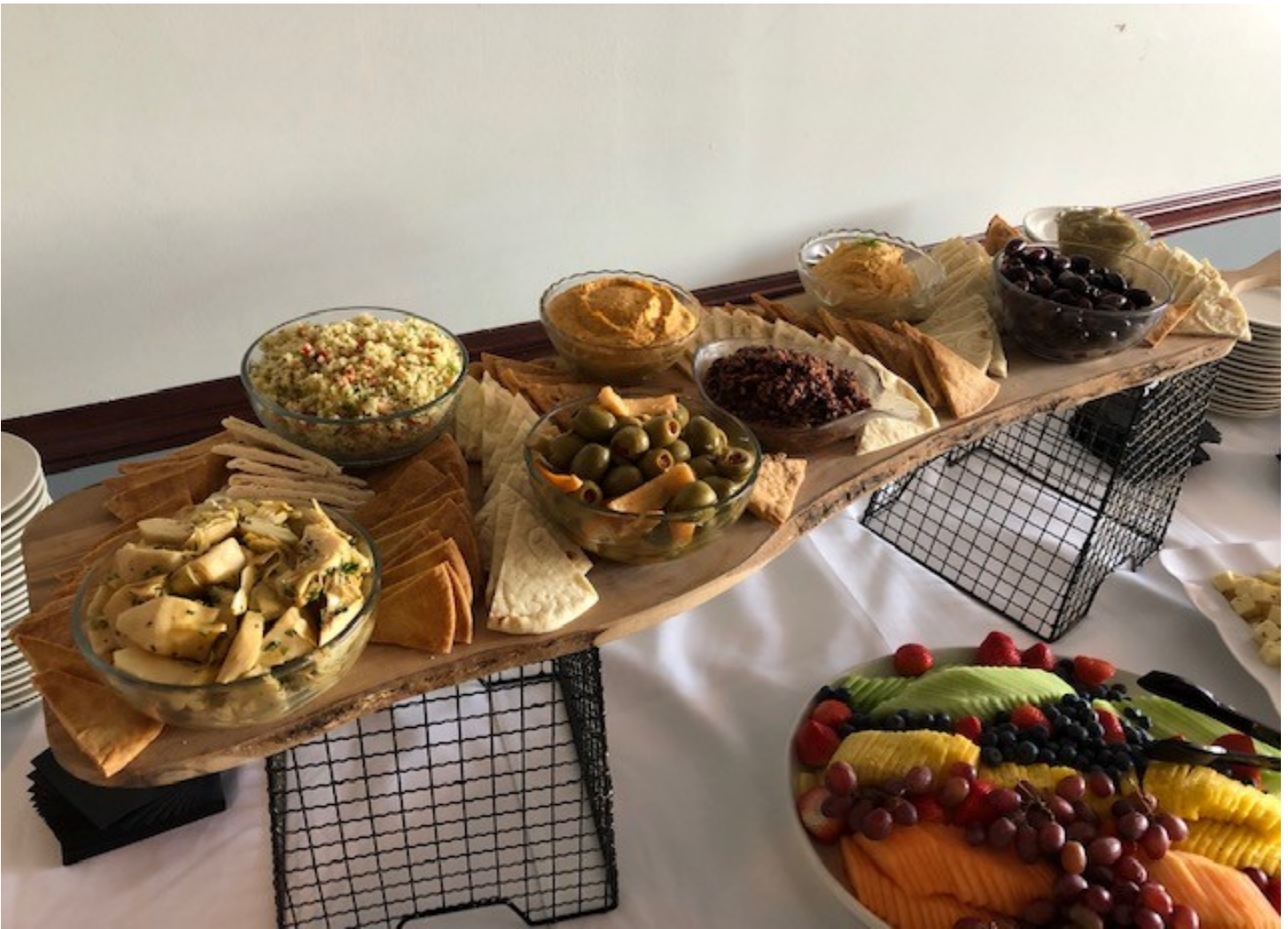
Mediterranean Charcuterie Display