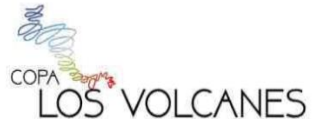
Central America Team Championship