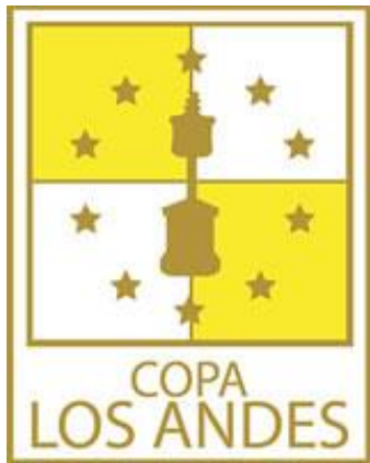
South American Team Championship