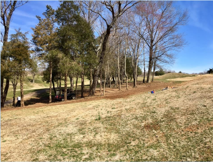
The hundreds of trees we have removed

We want our customers to have the most enjoyable round of their life when they play The Farm. It takes a lot of work behind the scenes to make that dream a reality. One of the biggest complaints we used to hear was place of play, and people kept losing their balls. Our maintenance team does everything in their power to make sure your dreams come to fruition. We spent all winter working hard on dressing up the course. Let us know if you see anywhere where we could keep improving. We love to hear your feedback.