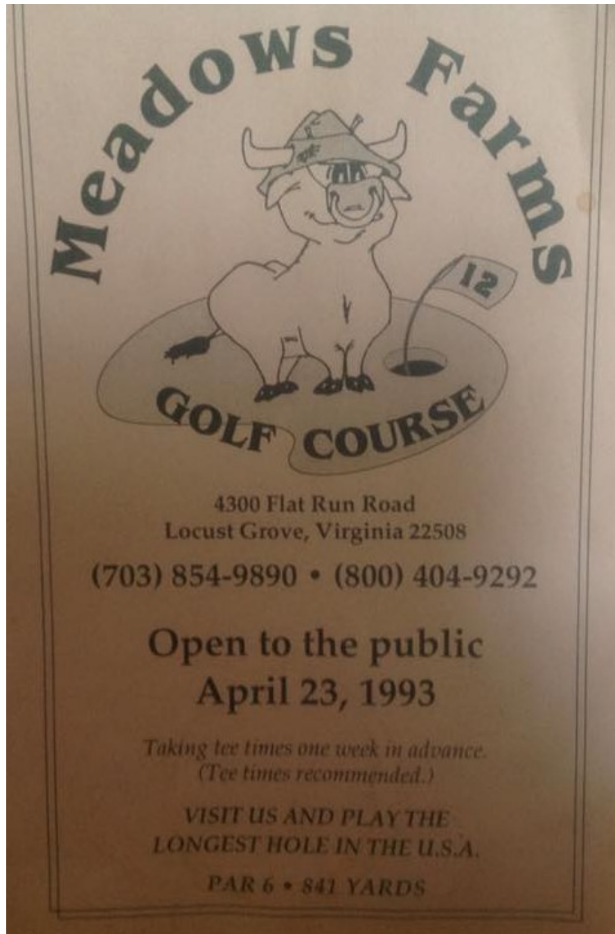
Above is the actual flyer Meadows Farms Golf Course used to promote the opening of the golf course back on April 23, 1993.