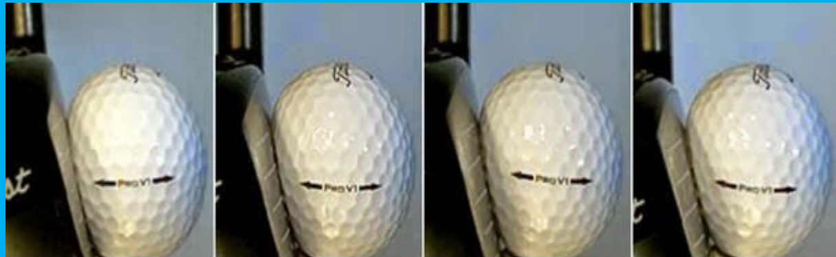
High Swing Speed driver

On the flip side, using a firmer ball when you don't have the swing speed to properly compress the core can have an adverse effect on launch characteristics, spin and control.