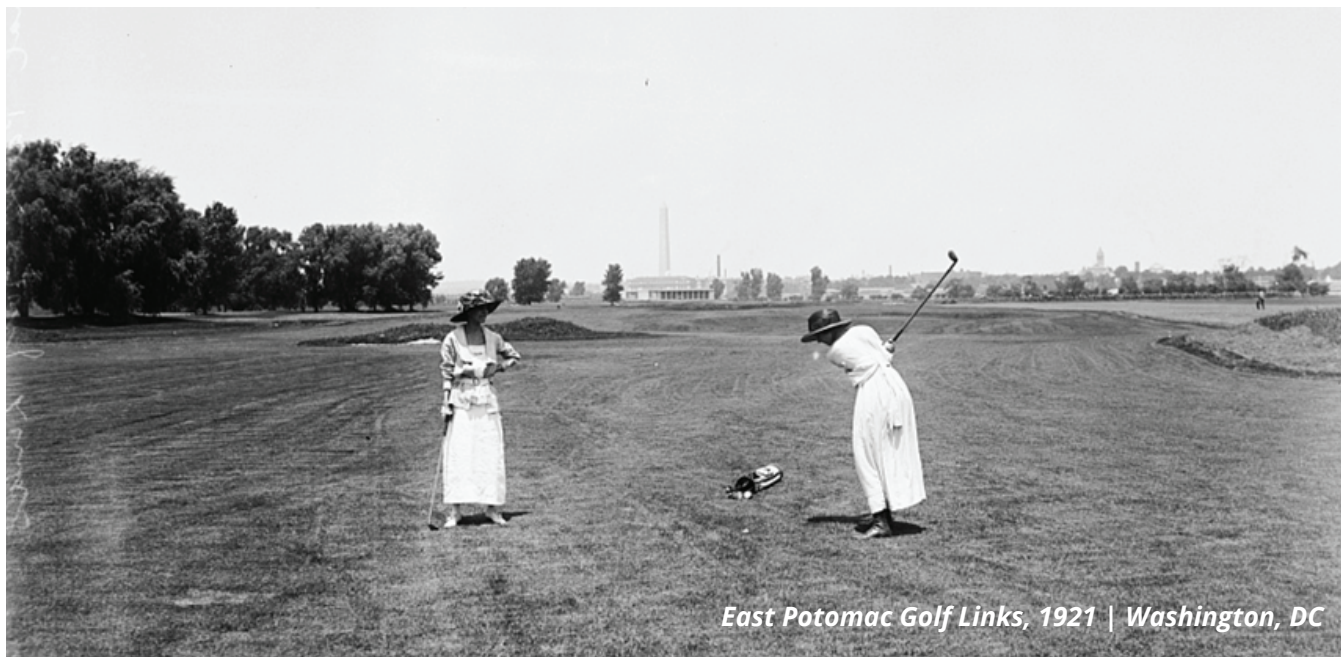
East Potomac Golf Links, 1921 | Washington, DC

Our work included: Financial Analysis, Course Asset Analysis, Course Management and Maintenance Analysis, Marketing Analysis, Trends Analysis, Programming and Community Engagement, Overview of Management Options, Capital Improvement Recommendations and Estimated Costs and Draft of an RFP for leasing the course in the future. The course is very popular with local golfers due to the interesting Donald Ross design features and popular fee structure and historically attracts over 40,000 rounds per year.