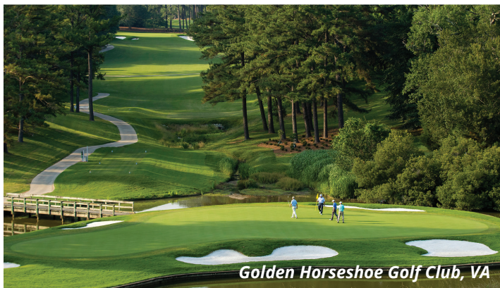
Golden Horseshoe Golf Club, VA

To assist our clients with determining and meeting their objectives in the golf and club industry.