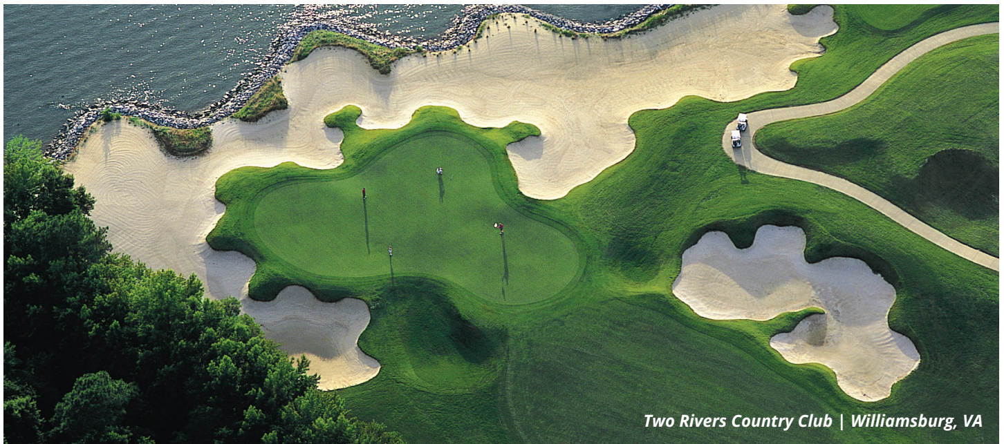
Two Rivers Country Club | Williamsburg, VA