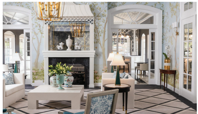
Greensboro Country Club (NC)