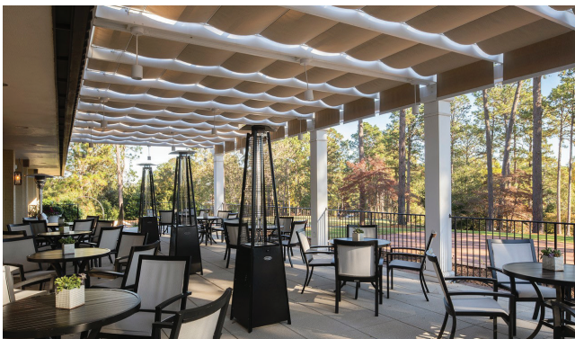
The Country Club of North Carolina (NC)