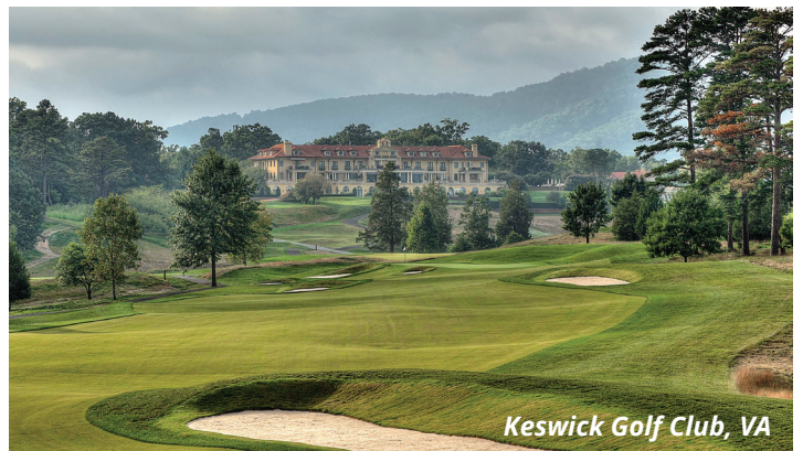
Keswick Golf Club, VA