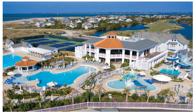
Bald Head Island Club (NC)