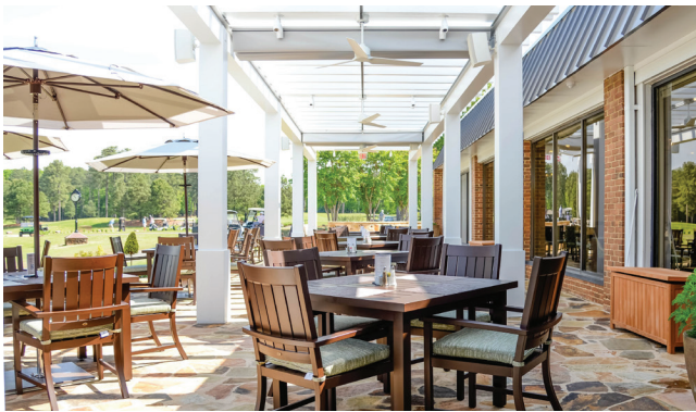
Hermitage Country Club (VA)

Learn more on their website: www.chambersusa.com .