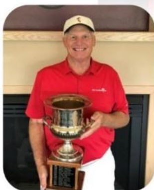
SENIOR CLUB CHAMPION