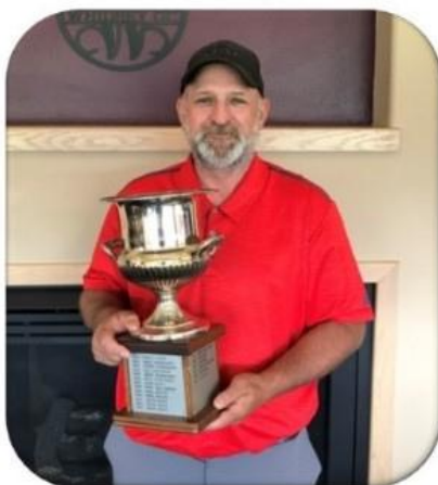
MEN'S CLUB CHAMPION