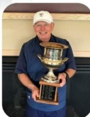
SUPER SENIOR CHAMPION