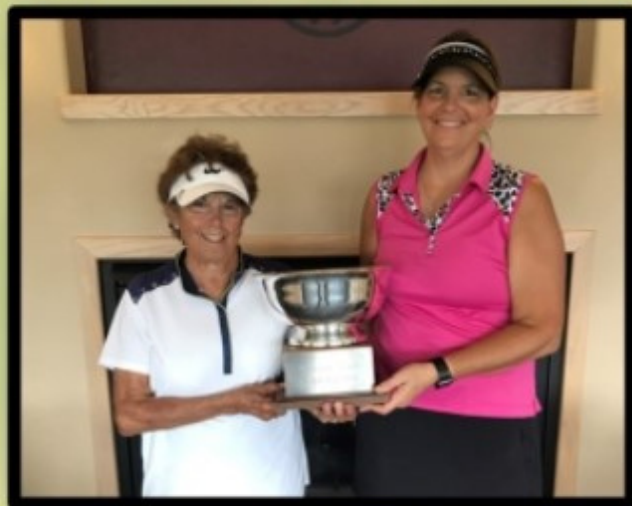
LADIES CLUB CHAMPION