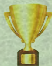
2016 Club Champions

Please make drink & food arrangements prior to teeing off or at the turn.