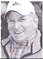
The Jerry Gibson Memorial Tournament