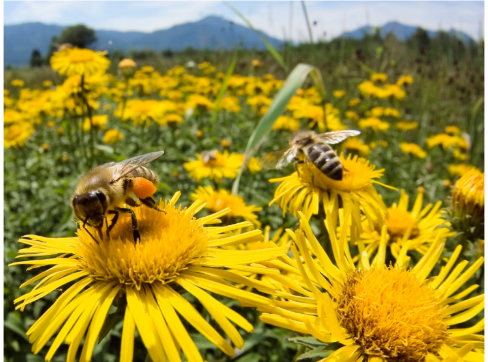
VGCSA Superintendents protect pollinators.

stakeholders from the agricultural industry and Virginia Tech, to draft a compromise bill that exempted out certified applicators and those under their direct supervision, such as golf course superintendents and their staff. The industry's BMP's were helpful in making the case that VGCSA members use neonicotinoids appropriately, and work to promote, and in many cases, cultivate pollinators.