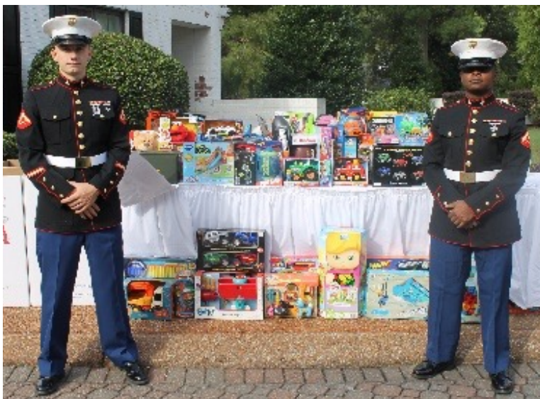
US Marines collect toys for deserving children.