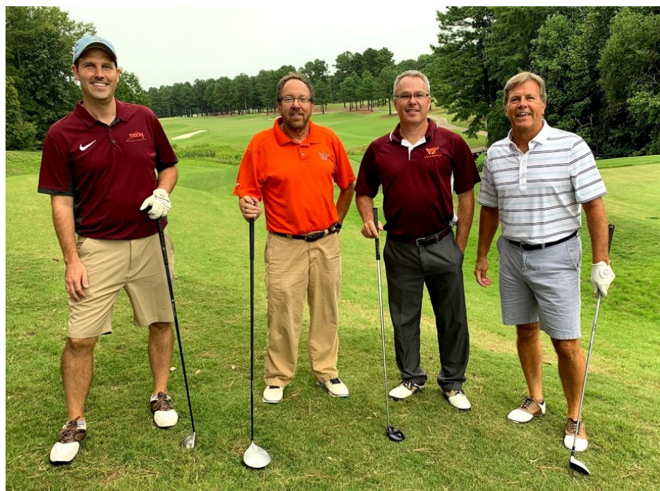
The Virginia Tech Turfgrass Team On-Site at Independence

Please visit www.vgcsa.org and www.vaturfgrass.org for event details and plan to attend!