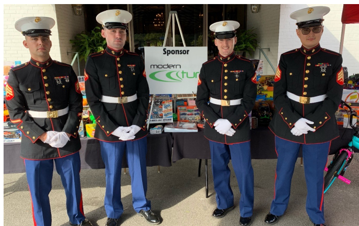
US Marines Accepting Toys for the Toys 4 Tots Program