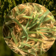
Insignia® Intrinsic® 0.7 fl oz / 1,000 ft²

Greens Height Cut Turf 14-day spray interval, July 2015