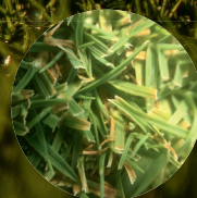
Heritage® Action™ 0.4 oz / 1,000 ft²