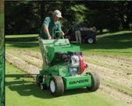
Graden with Sand Injection

Call us at: 1-800-888-2493 or email: harmonturf@comcast.net