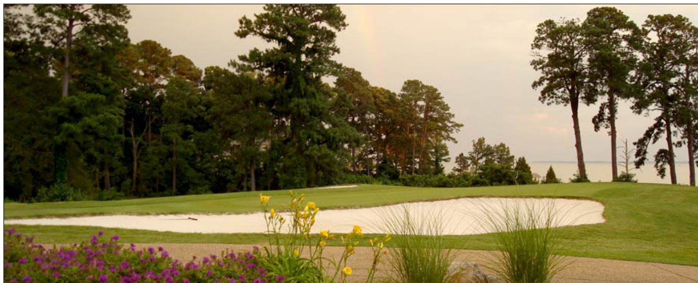
The 18th hole of James River CC with the river in the background