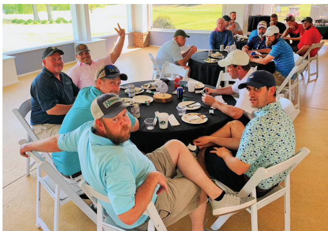
Participants in the 2019 event enjoyed the social event.