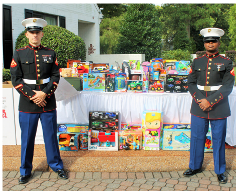
US Marines collect toys for deserving children.