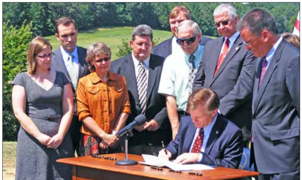
Governor Bob McDonnell (seated) signs one of eight pieces of environmental stewardship legislation into law at Brookmeade Sod Farm.

The VGCSA has been a part of the coalition formed by the Virginia Agribusiness Council to advance measures that protect Virginia's golf industry.