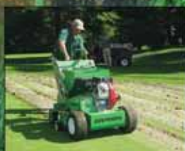
Graden with Sand Injection