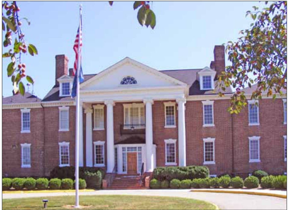
The VGCSA annual meeting will be held on January 17, 2012 at the Fredericksburg Country Club.

Fredericksburg Country Club is conveniently located about 15 minutes from the conference hotels, and the