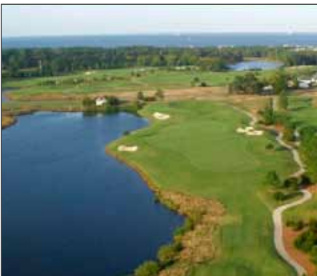
Bayville Golf Club in Virginia Beach

"A golf course is a good place to be. It's good for your health. It's a carbon sink. It's wildlife habitat. It's a water filter. I think golf has a good future when people understand these things."