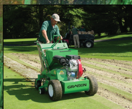
Graden with Sand Injection