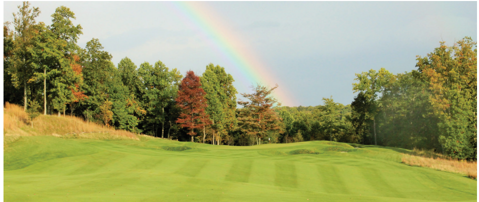
Primland Resort was the #1 auction item again this year.