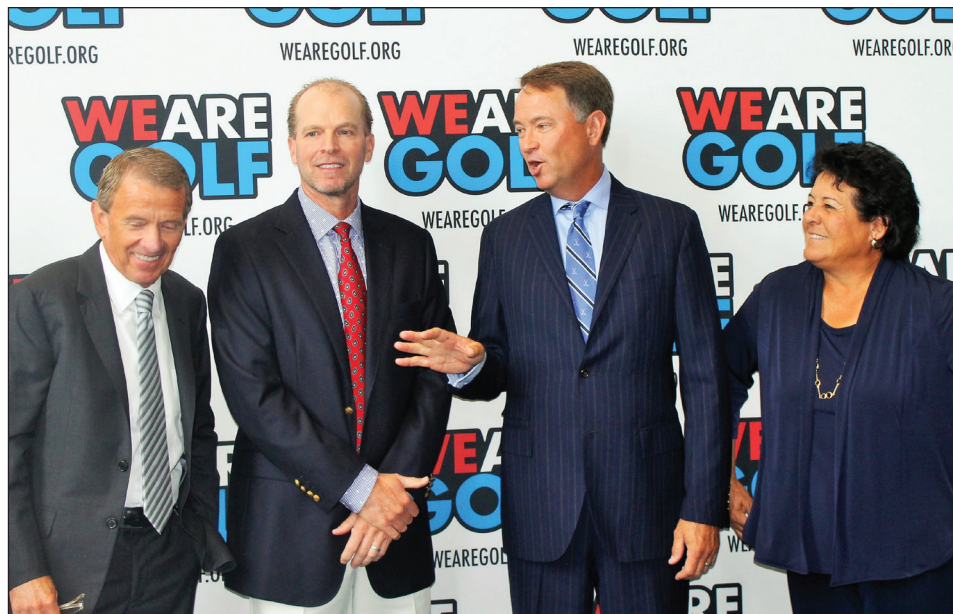
PGA Tour Commissioner Tim Finchem with Steve Stricker, Davis Love and Nancy Lopez.

Organizations participating were the Club Managers Association of America, Golf Course Superintendents Association of America (GCSAA), Ladies Professional Golf Association, National Golf Course Owners Association, PGA of America (PGA), PGA TOUR, United States Golf Association, United States Golf Manufacturers Council, World Golf Foundation and others.