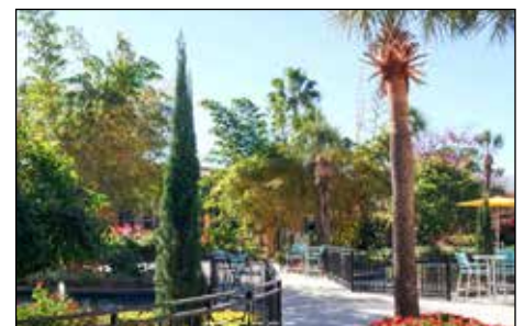
This year's Social Event will be poolside.