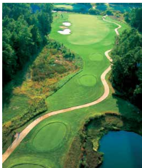
Fawn Lake Country Club