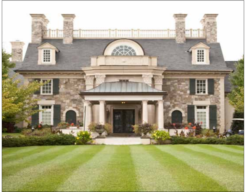
Belle Haven Country Club

The competition is set for October 23-25, with teams of 8 players going head-to-head in four-ball, foursomes and singles matches. The VGCSA Team qualified at the VGCSA Championship and at various regional qualifiers. Syngenta is the founding sponsor of the event.