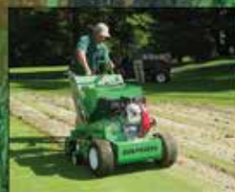
Graden with Sand Injection

Call us at: 1-800-888-2493 or email: harmonturf@comcast.net