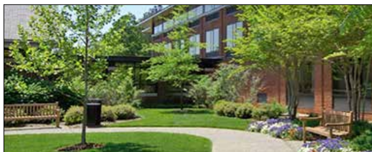
Williamsburg Woodlands Conference Center