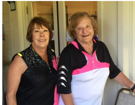
COUPLES SUMMER SCRAMBLE HOSTS