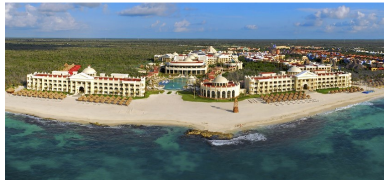
ABOVE: the all-inclusive Iberostar Grand Hotel Paraiso Cancun, Mexico October 29 – November 5 2016