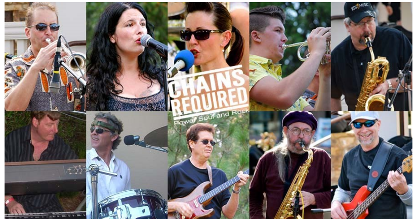
Saturday July 1 Saturday August 5 CHAINS REQUIRED