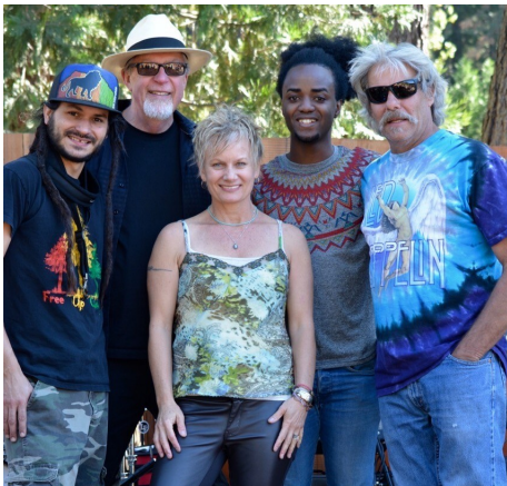
Saturday May 27 Saturday September 2 JILL & the GIANTS

(price includes dinner, music, sales tax & gratuity)