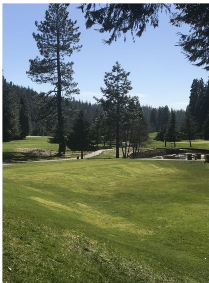
Beautiful days in March!